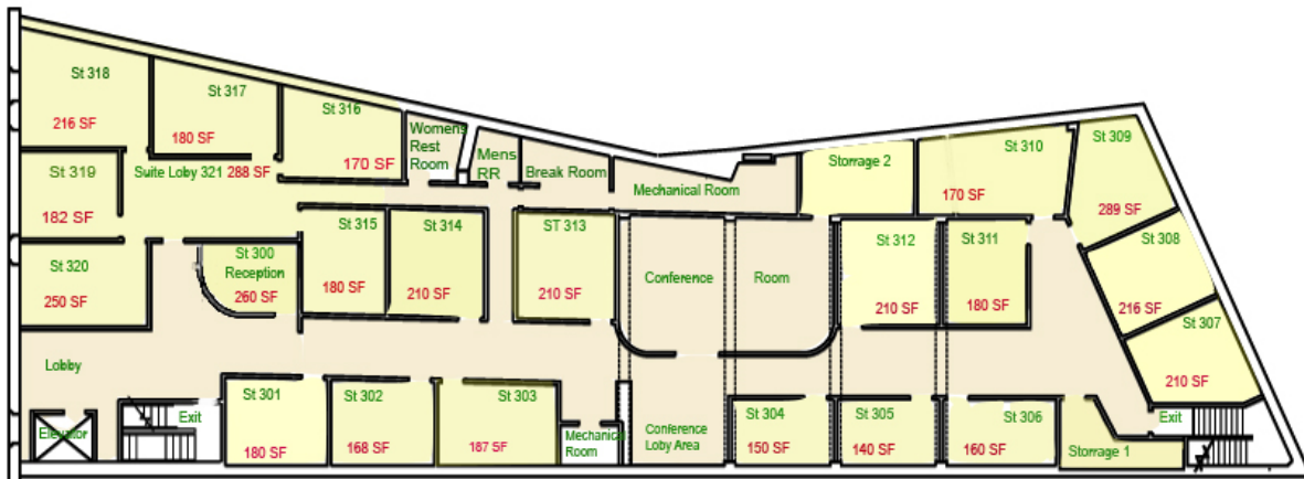
314 Last Chance Gulch Existing Third Floor Plan scale: 1/16" = 1'-0"