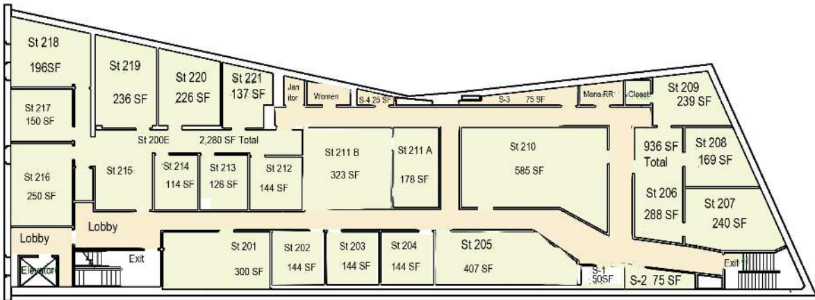
314 Last Chance Gulch Existing Second Floor Plan scale: 1/16" = 1'-0"