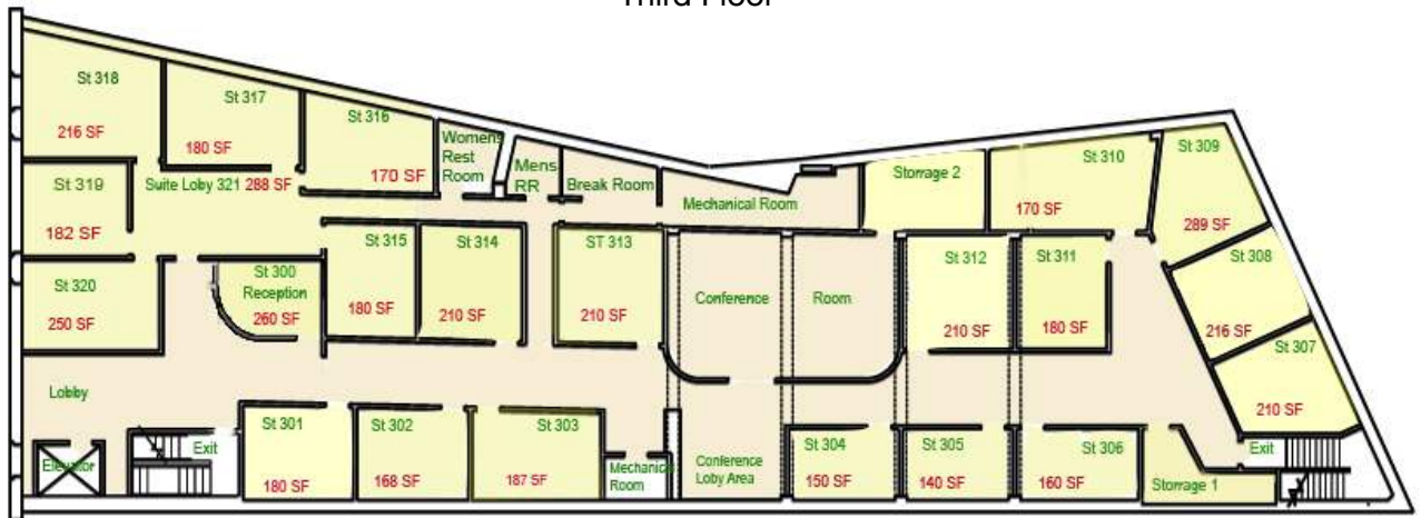
314 Last Chance Gulch Existing Third Floor Plan scale: 1/16" = 1'-0"